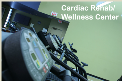
Cardiac Rehab/ Wellness Center